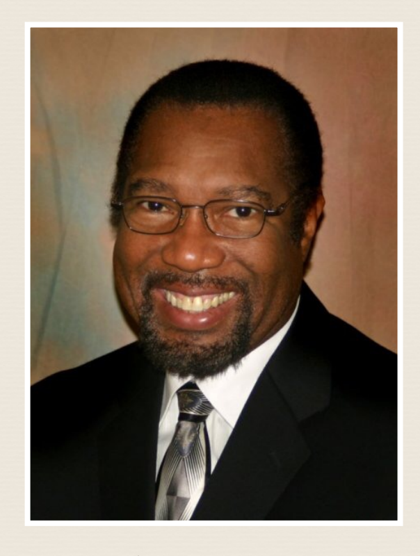
August 22, 1948 to February 7, 2016